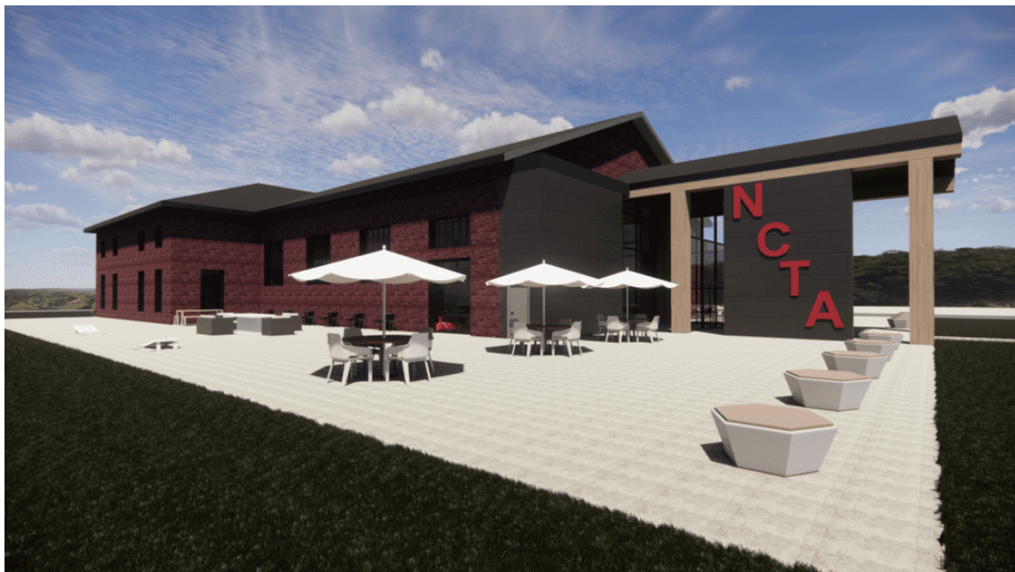
Conceptual image of exterior of Student Success and Activity Center at Nebraska College of Technical Agriculture

At NCTA, the couple’s gift will support a $12 million project to create the Student Success and Activity Center on campus. The Weitzes’ challenge gift will be matched by $6 million in other private funding, with work to begin after fundraising is complete. Donations may be made online .