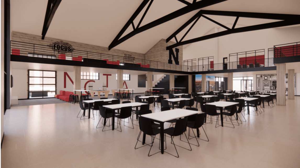
Conceptual image of interior of Student Success and Activity Center at Nebraska College of Technical Agriculture