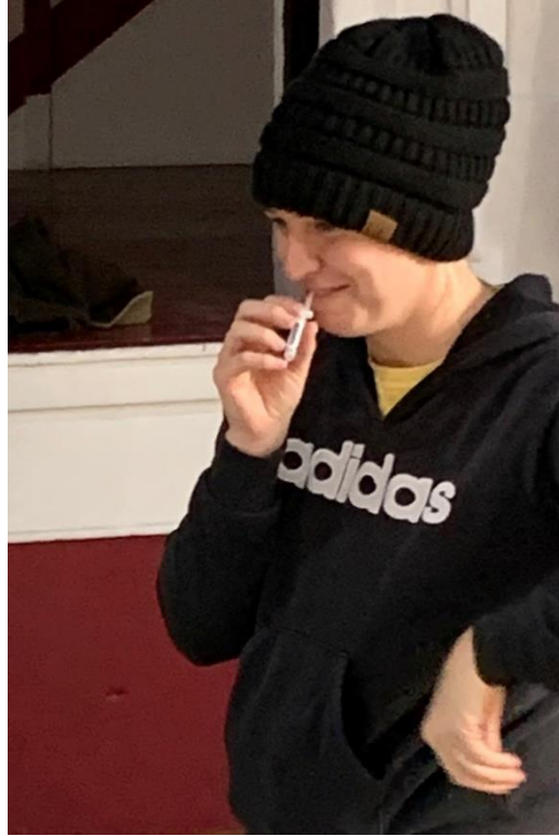
COVID saliva tests were administered by NCTA staff on Jan. 10 and Jan. 11. Student provides a saliva test.