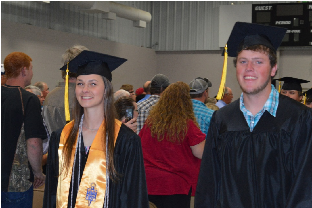
The Glenn Jurgens Memorial Scholarship is for students who attend the Nebraska College of Technical Agriculture.