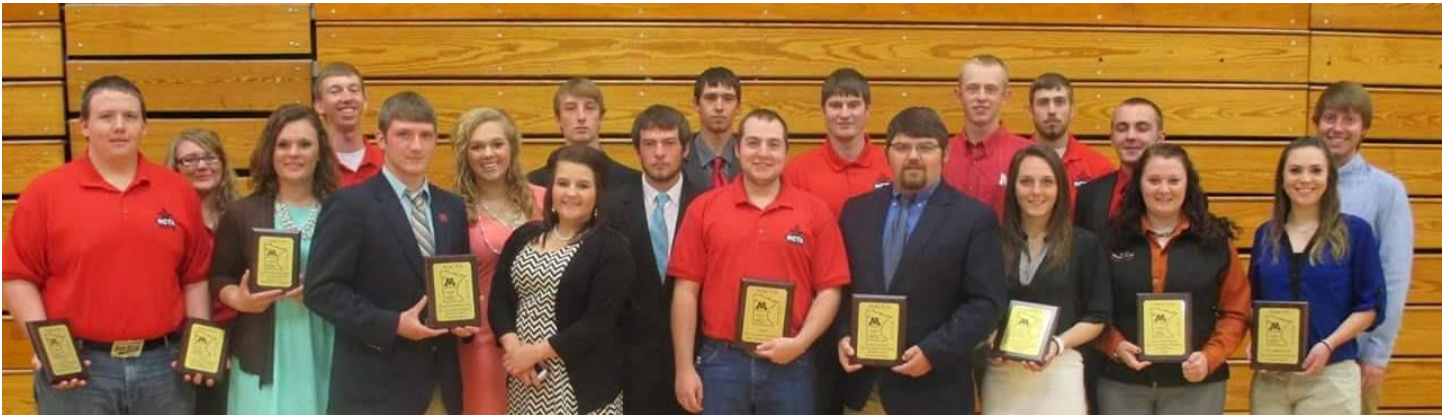
NCTA national champion teams in crops judging and agricultural computer won titles April 14-16 at the University of Minnesota-Crookston. The Nebraska College of Technical Agriculture, Curtis, had 21 students in the national competition.